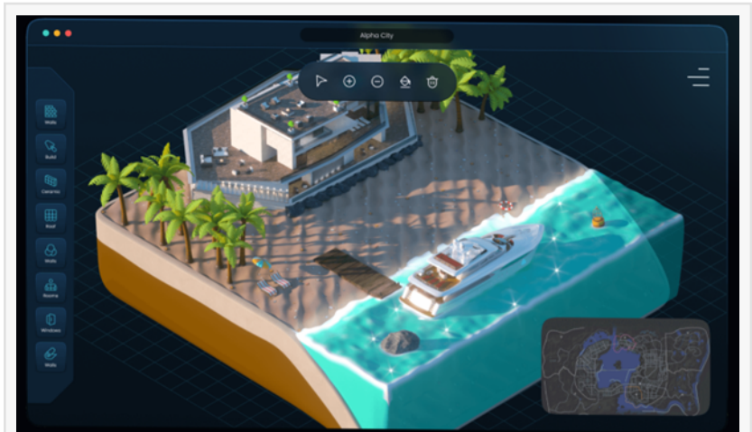
Alpha City - Build the ultimate living and business spaces for your Avatar or others to experience in VR!!

Alpha City will have its own utility token $AMETA to be used as currency. The token will be traded on the base network and will be used for all transactions in the Metaverse. Most tokens once spent will be forever locked in the environment and some will be “burnt” or destroyed thus reducing the number of coins available.